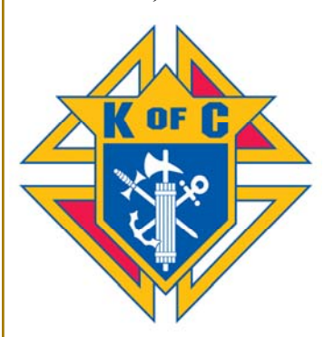
In Service to One. In Service to All

Knights of Co1umbus 180 S. Russell Ave Aurora, IL 60506